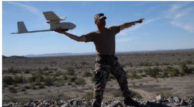
Figure 1. Raven Air Vehicle Launch Stance